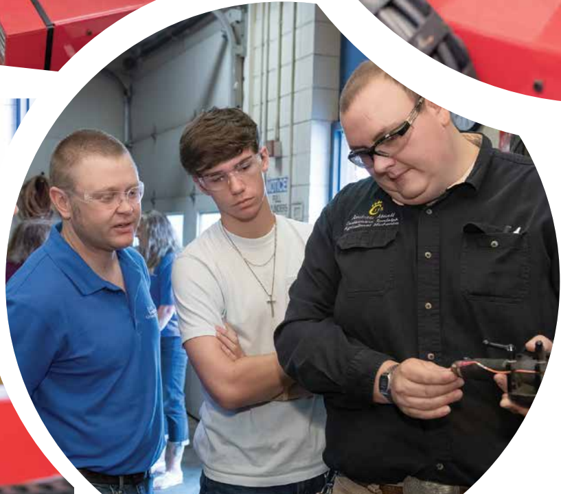
◀ The new grant-funded plasma table will help North Carolina high school students learn key career skills.