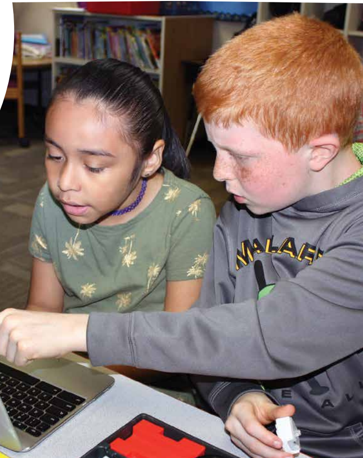
▲ Students from Tenino, WA, show off the technology in their STEM Labs.